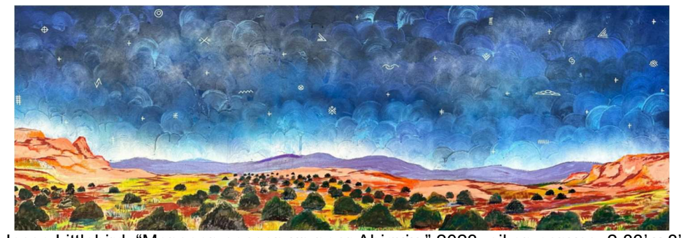
Jesse Littlebird, "Monsoon season up near Abiquiu," 2023, oil on canvas, 2.83' x 8'