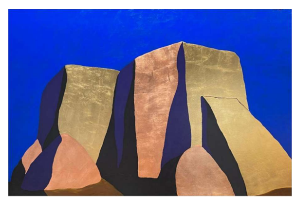
Alvin Gill-Tapia, "Saints View at the Asissi," 2023, gold and copper leaf and acrylic on linen, 4' x 6'

The Committee reviewed over 315 submissions expressing interest in the TSA North Wall (purchases and commission). The Committee selected 5 artworks for purchase from 5 New Mexico artists listed below.