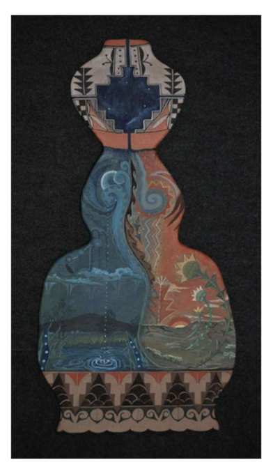
Deborah Jojola, "Equilibrium," 2023, fresco with earthen plaster and pigments, 2.96' x 1.5' x 1"