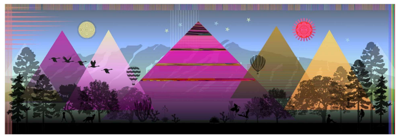
J P 제피, We are of the Mountain, mixed-media mural, 17' x 50'

The Committee reviewed 379 submissions for the TSA North Wall Commission. After multiple rounds of review, the Committee identified 6 finalists who submitted design proposals. J P 제피's proposal, entitled, We are of the Mountain , was selected for the TSA North Wall Commission site, pictured below. J P's We are of the Mountain will be recommended to City Council for Award. Installation will begin once approved by City Council.