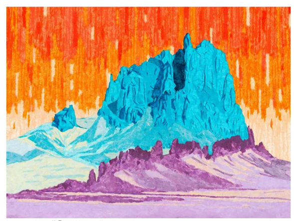
Virginia Primozic, "Sailing," 2021, paper on canvas, 2.5' x 3.33' x 1.5"

TSA North Wall Commission – Commission of two-dimensional or low-relief, three-dimensional artwork for the TSA North Wall in the queueing area.